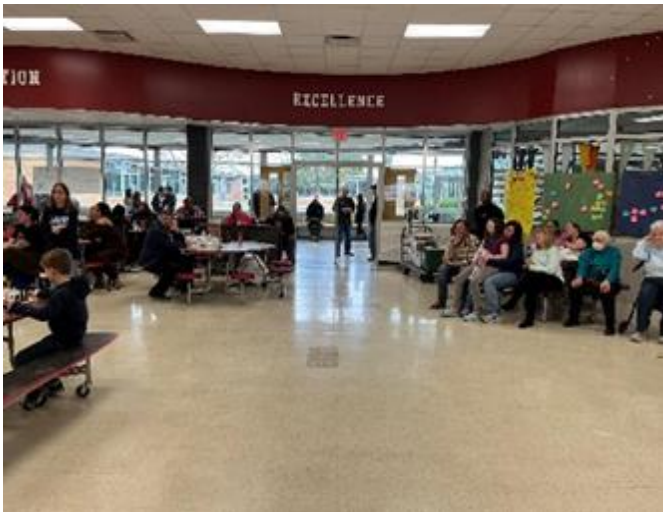
The final round begins !