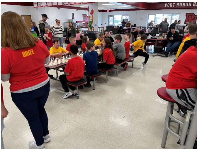
Tournament action gets underway!