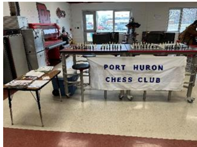
The PHCC tables are ready for play and perusal!