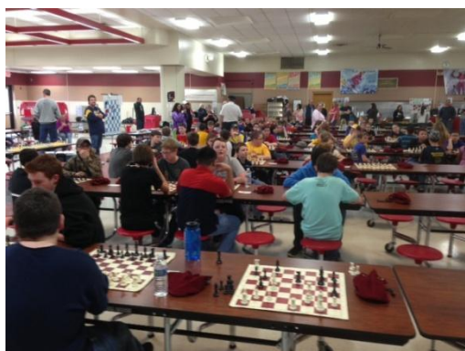
Participants get a few practice games in before the tournament begins.