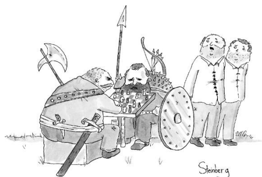
“Ob, it always starts politely.”